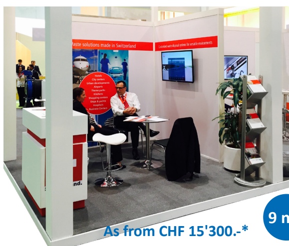
As from CHF 15'300.-*