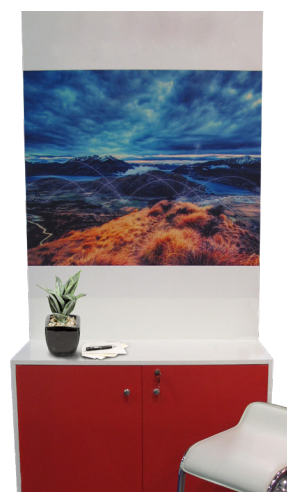
As from CHF 7'480.-*

*Member price: Swissem members benefit from a reduction of CHF 200.- per m2